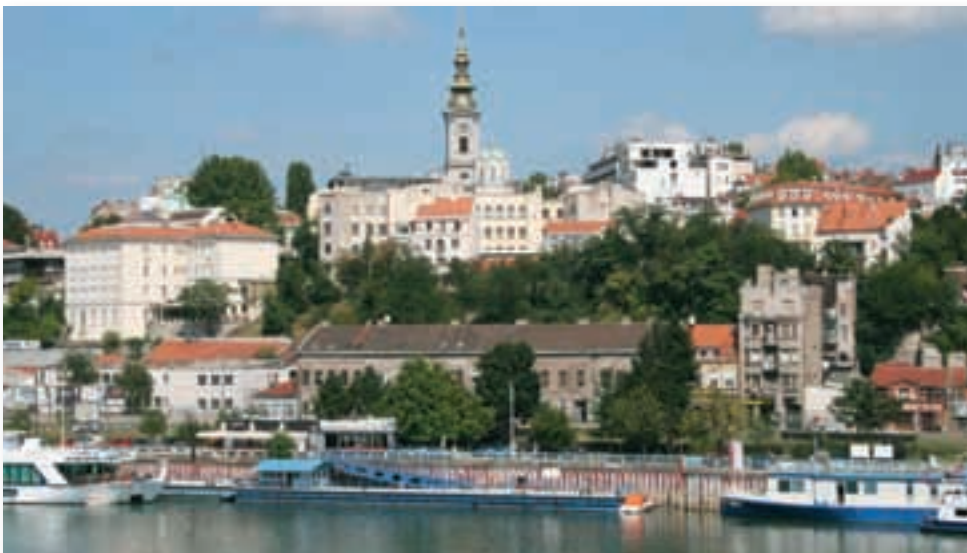
Belgrade from the river

Belgrade is in the vicinity of archaeological sites of great importance both according to the global and European parameters, and that makes it special. It is also near popular small towns and other natural and cultural values of great importance.